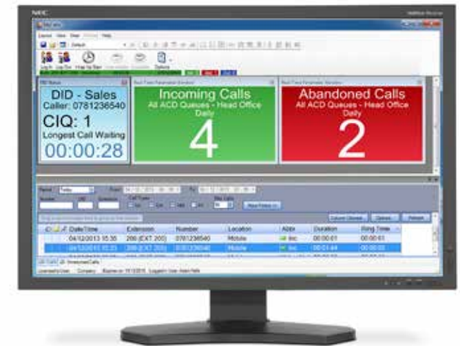
A real-time snapshot of all personal call activity including agent status, call history plus a mini wallboard of group activity

“Allows even a small team to deal with fluctuating call traffic”