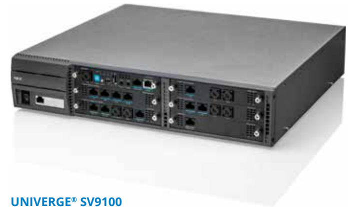
UNIVERGE® SV9100 Free MyCalls Desktop Lite

FREE with every SV9100 - a slimmed down version of MyCalls Desktop – this offers similar functionality bar, presence and 10 as opposed to 1000 DSS (Speed Dial & Busy Lamp Field) keys.